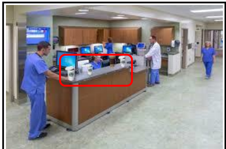
In patient/resident care areas

OSHA's bloodborne pathogens standard prohibits the consumption of food and drink in areas in which work involving exposure or potential exposure to blood or other potentially infectious material takes place, or where the potential for contamination of work surfaces exists [29 CFR 1910.1030(d)(2)(ix)]. Also, under 29 CFR 1910.141(g)(2), employees shall not be allowed to consume food or beverages in any area exposed to a toxic material.