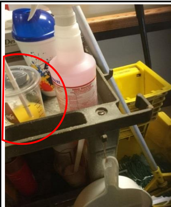
Near chemicals or in Environmental Service closets