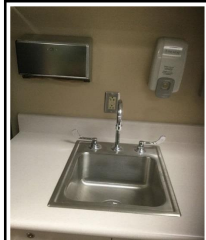
Splash zone empty – Good