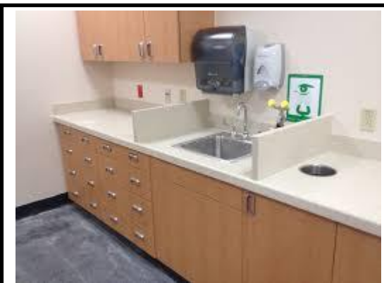
Sink with splash guard – Good