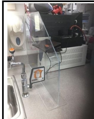
Sink with Plexiglass splash guard - Good

Resources: Centers for Medicare and Medicaid Services Survey Tool https://www.cms.gov/Medicare/Provider-Enrollment-and-Certification/SurveyCertificationGenInfo/Downloads/Survey-and-Cert-Letter-15-12-Attachment-1.pdf